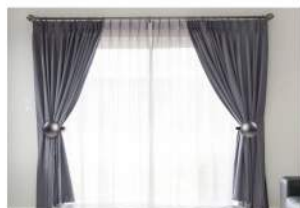
Curtains + Curtain Rods