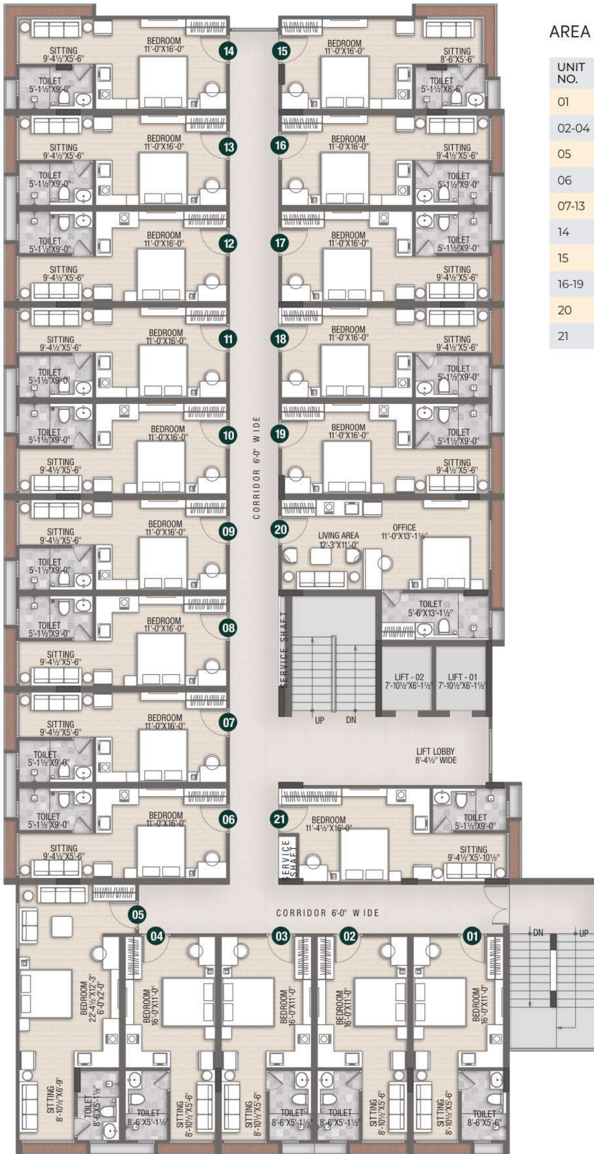
TYPICAL FLOOR PLAN (2nd to 6th)