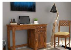
Study Table With Chair + Lamp