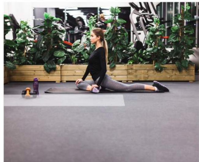
YOGA/ MEDITATION AREA