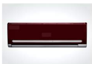
AC 1.5 Ton