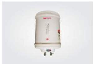
Gyser (10 Ltr.)