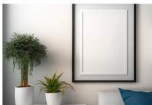
Wall Decorative Photo Frames