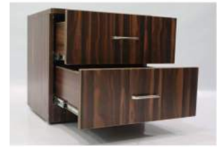
Bed Side Box